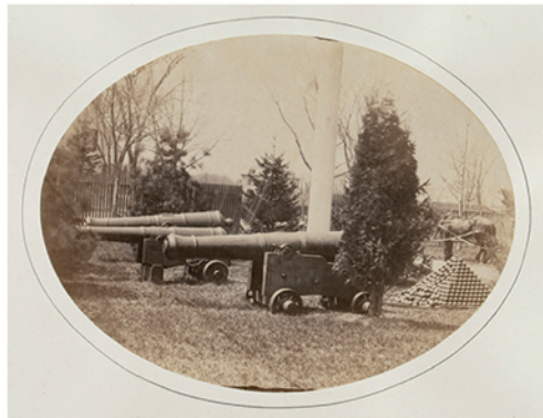
Velvety Matte with coatings