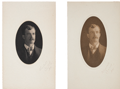
Velvety Matte with coatings