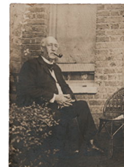
Velvety Matte (with matting agents)